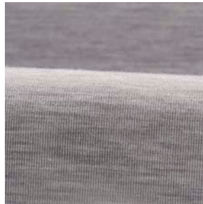
JMST3010 COURSE TEE