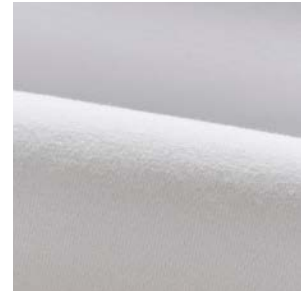
JMPO3000 THE ORIGINAL