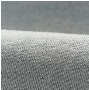
JMST3180 DALE 2.0